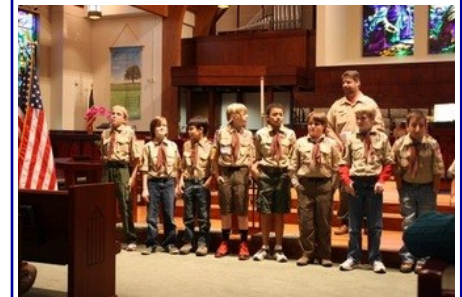
Scouts are recognized for earning their Webelos Rank award at the Blue and Gold Ceremony