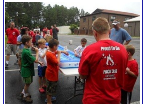
Scouts and their families have some fun racing boats at the Raingutter Regatta event

Cub Scout Pack 318 and Troop 318 North Raleigh United Methodist Church 8501 Honeycutt Road, Raleigh NC 27615