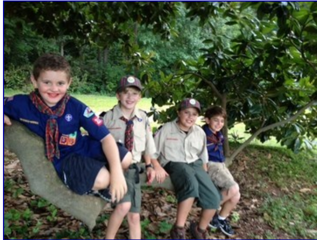
Building fellowship through scouting