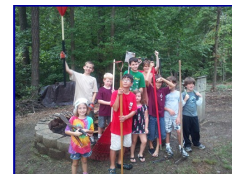
Scouts participate in the NRUMC Grounds Workday

The Scout Program recognizes that Service is a great spiritual development for younger people. Our scouts organize, contribute, and participate in a variety of Community Service projects.